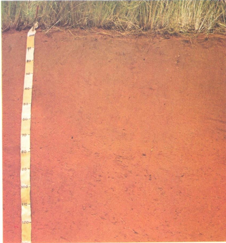
HUTTON FORM — Hu