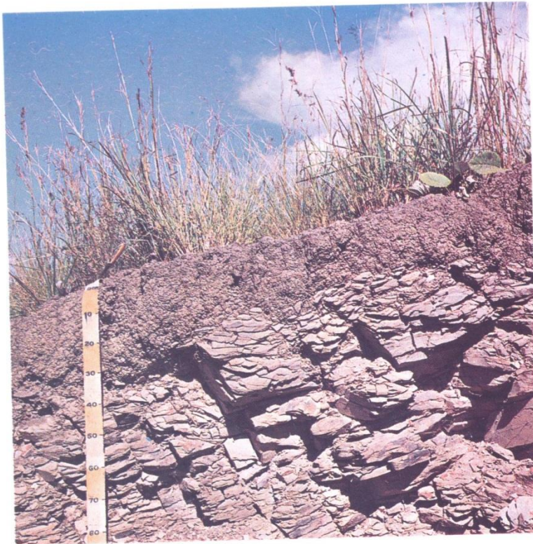
MISPAH FORM — Ms