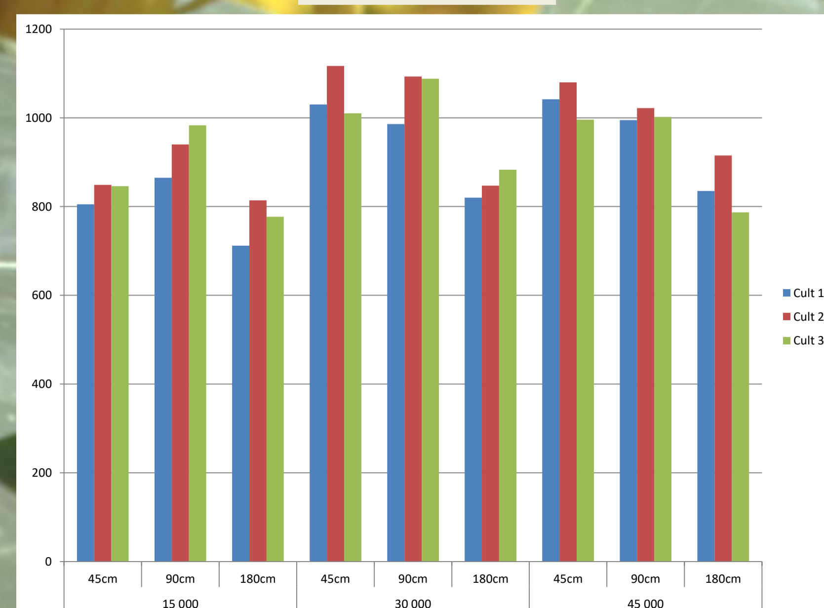
Oil Yield Kg ha -1

The influence of cultivar and plant population on the average seed yield for the seasons and the influence of plant population and row width on the seed yield for the seasons.